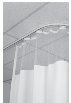
See Curtains on Page Two