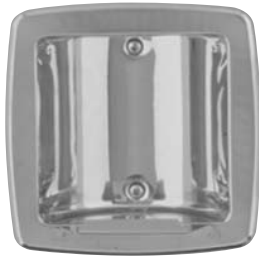
Shown with Bright Finish Model 821B