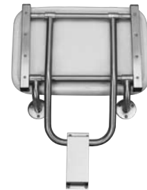
Folded Up Against Wall